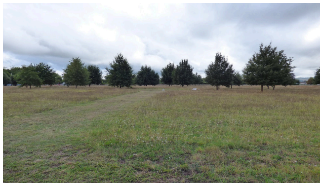
The site for the commemorative sculpture located within the oak arboretum.

Some of the highlights of the visit were - the blessing of the site for the commemorative sculpture including the presence of Fred Graham the designer; the informal dinner at a private function centre set amongst amazing grounds complete with the accompaniment of the Cambridge Brass Band Quintet and the Cambridge Brass Band who also played at the formal lunch the following day hosted by our Mayor; a visit to the velodrome; the final farewell appropriately at St Andrew's Church and the involvement of students from Cambridge High School and Cambridge Primary School. As a gift we gave the delegation a copy of the book "ANZAC War Story and Poetry" written by Karina Fitch, a local resident. It was an uplifting and thoroughly enjoyable experience and all can be proud of their part in making it the success it was. One of the delegates, Olivier Duquesnoy has indicated that he will be in Cambridge for the Armistice weekend this year, so it will be great to welcome him back.